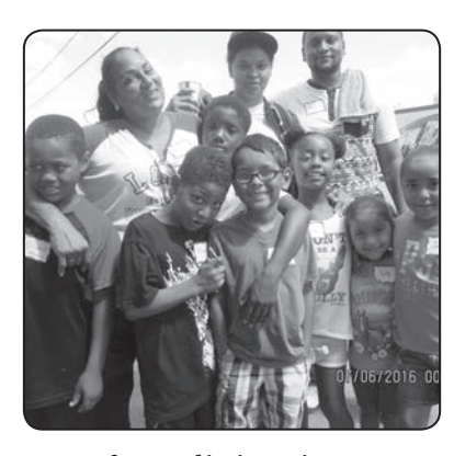
Happy faces of kids and parents having a great day enjoying our Annual Family Day at Como Park this summer!