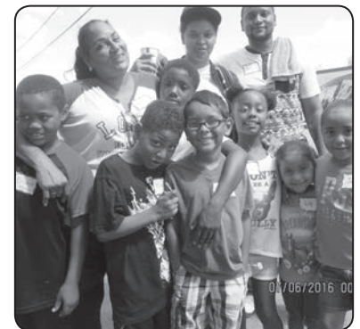
Happy faces of kids and parents having a great day enjoying our Annual Family Day at Como Park this summer!