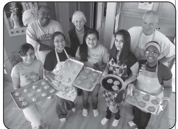
Teen baking class at St. Jane House